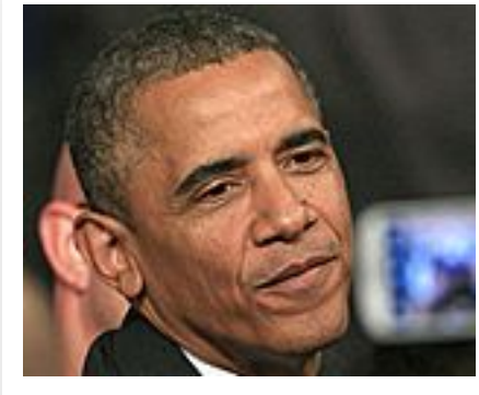
Thomas Sowell - Obama and the Art of Phoniness