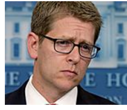
Thomas Sowell - Feeling Sorry for Jay Carney