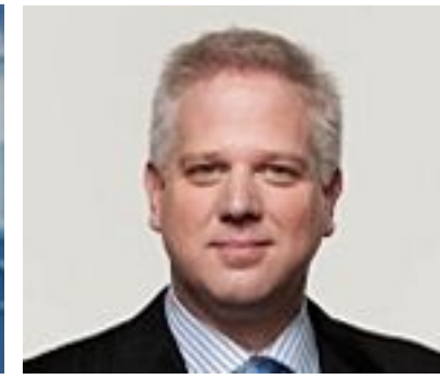
Glenn Beck Has Had Enough: 'I, Personally, Am Calling To Impeach The Downtrend.com