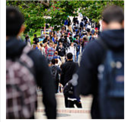
Kevin D. Williamson - Tuition Showdown