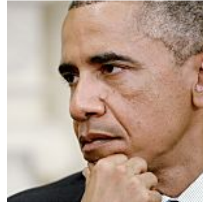
Charles C. W. Cooke - Obama's Imperial Transformation Is Now Complete