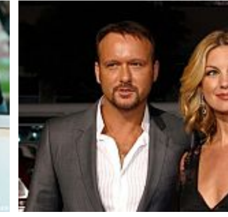
Tim McGraw & Faith Hill Share Big News About 'Divorce'